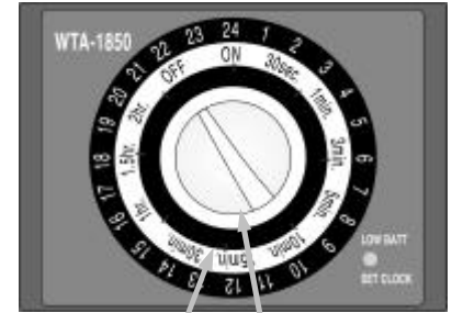
Clock Dial Duration Dial